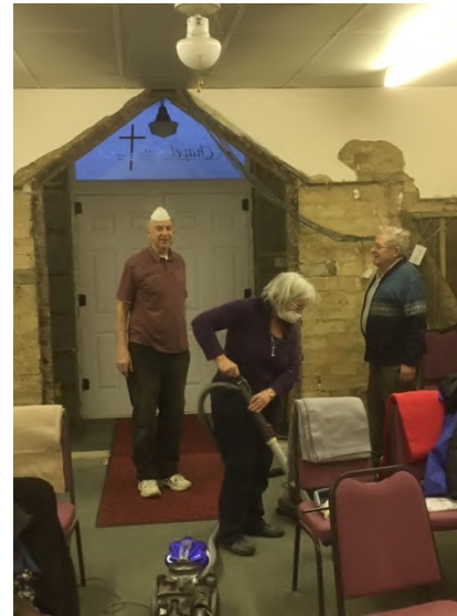
1 worker, 2 'Advisors'