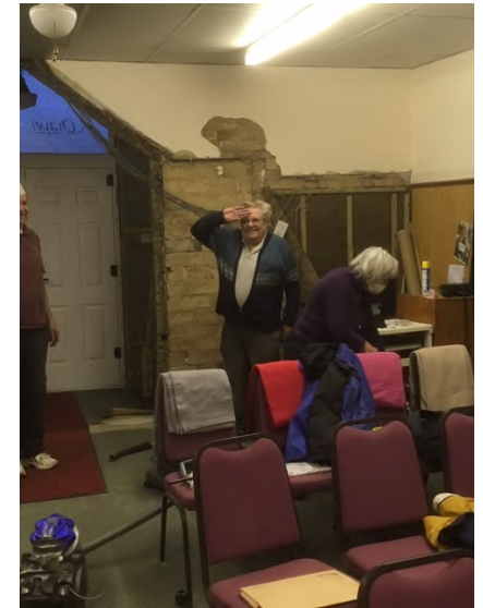
Ready for Inspection